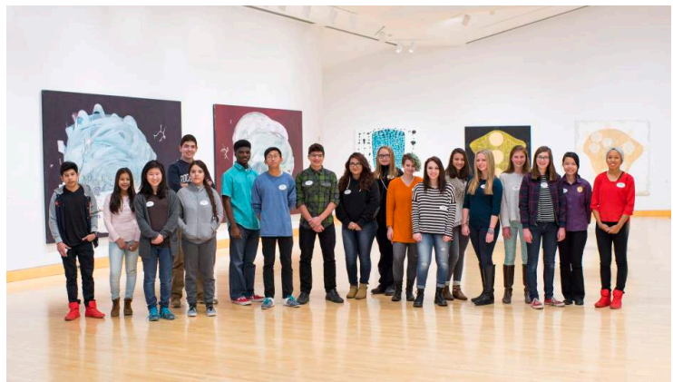
No Boundaries Teen Art Initiative 2016 Participants