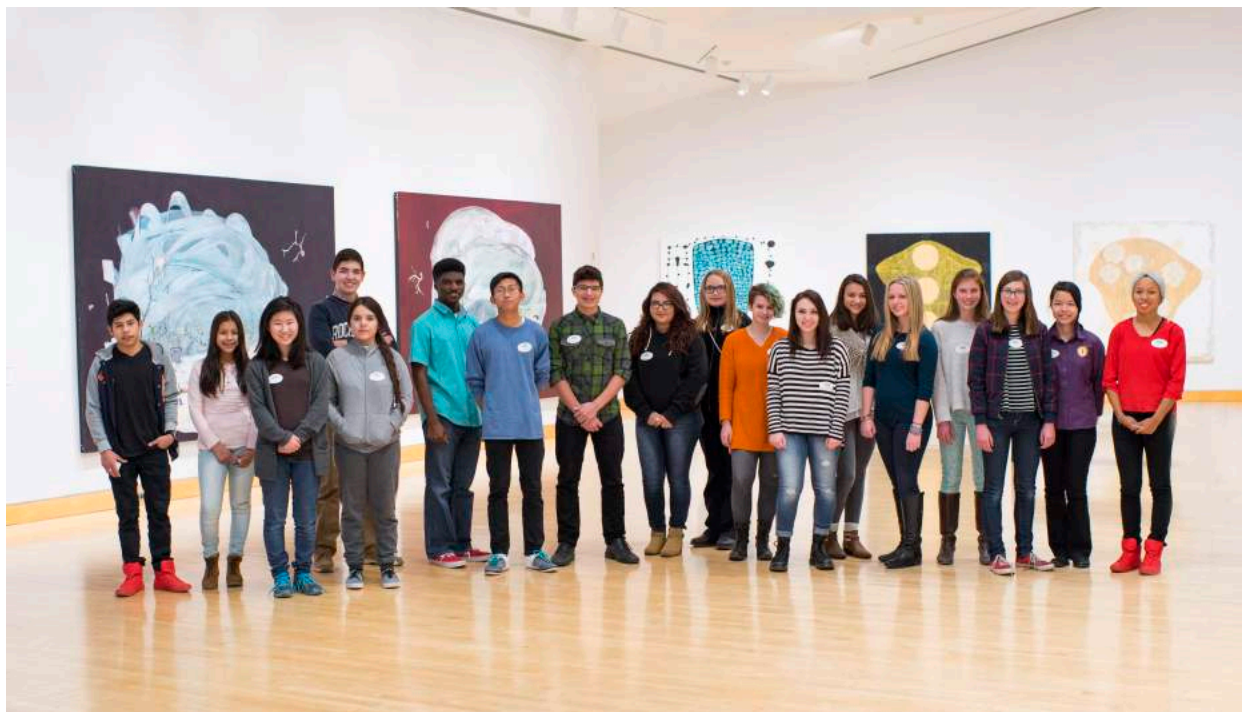
No Boundaries 2016 Teen Participants