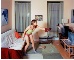
Anthony Lepore American, born 1977

Untitled (Brooklyn, NY) , 2005 from the series I Would Make You My Own pigment print on paper, edition 1 of 10, 27 x 34 inches Gift of the artist and Marvelli Gallery, New York, 2009.01.01.