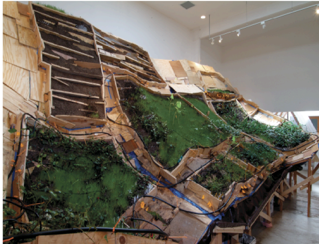
Phoebe Washburn, It Makes For My Billionaire Status , 2005; installation view, Kantor/Feuer Gallery; mixed media, dimensions variable; Courtesy Kantor/Feuer Gallery, Los Angeles

to express divergent styles and concepts. Stephen Hendee, who is based in Las Vegas, uses simple materials like corrugated plastic sheets, photo tape, fluorescent lights, and hot glue to create multi-faceted, glowing, geometric landscapes that summon comparisons to the stage sets of science-fiction films, like the 1982 cult classic Tron . While the